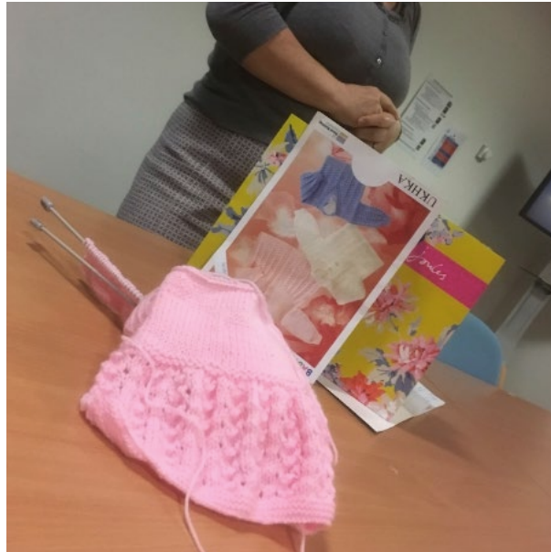
Senior Charge Nurse:

Life is a cardigan in progress, it needs a pattern, process and be a little soft and woolly ... Group coaching made me think differently about asking questions and being questioned ... I don't have to do it all myself ... I am more controlling than I thought, and I need to be able to hand over control ... I found the stories from the army thought provoking.